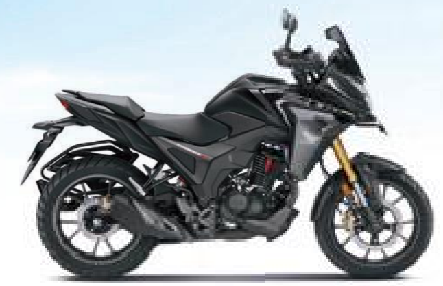
PEARL NIGHTSTAR BLACK

Dealer Stamp Nxtgen Jhaveri Honda Shop No. 4, Kanakia Zillion, Next to Kuria Bus Depot, LBS Marg, Kuria (W) Mumbai Tel: Sales: 9820492650 Mob: Service: 9820163503